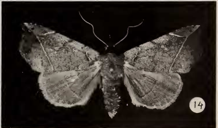
Gulch, 28-V-81, wing expanse 35.9 mm. 10 , Hemispragueia idella Barnes, Presidio Co., Ruidosa Hot Springs, 8-VII-69, wing expanse 23.5 mm. 11 , Lesmone fufius (Schaus), Hidalgo Co., Santa Ana Refuge, 13-IX-80, wing expanse 26.2 mm. 12 , Lesmone formularis (Geyer), Hidalgo Co., Santa Ana Refuge, 28-XI-75, wing expanse 30.8 mm. 13 , Eulepidotis addens (Walker), Hidalgo Co., Bentsen Rio Grande Valley St. Pk., 11-X-80, wing expanse 26.8 mm. 14 , Gonocarsia electrica Schaus, Brewster Co., Big Bend Nat'l. Park, Green Gulch, 7-X-66, wing expanse 40.5 mm. (Figures not at same scale. Full wing expanse given for each specimen.)